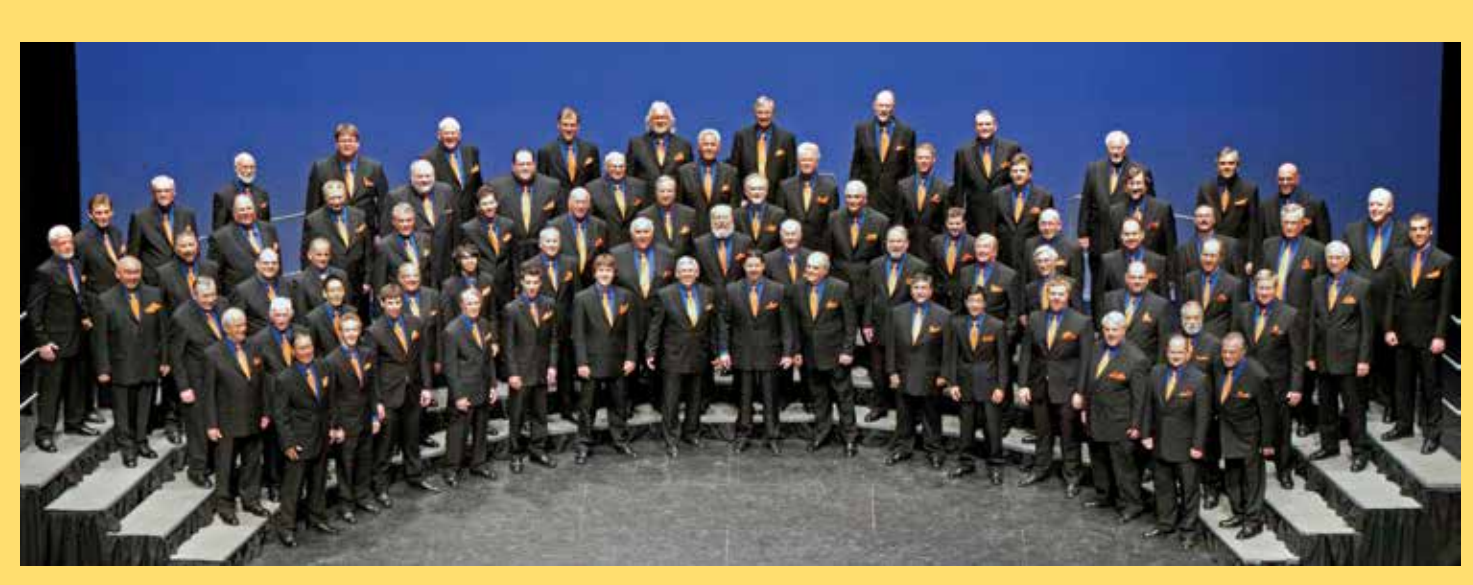
Voices of California