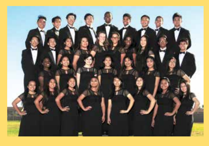
Franklin High School Vocal Ensemble